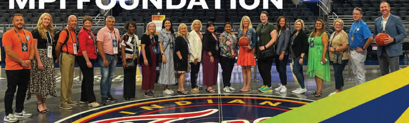
Pictured: MPI Foundation Thought Leaders Summit, August 2024