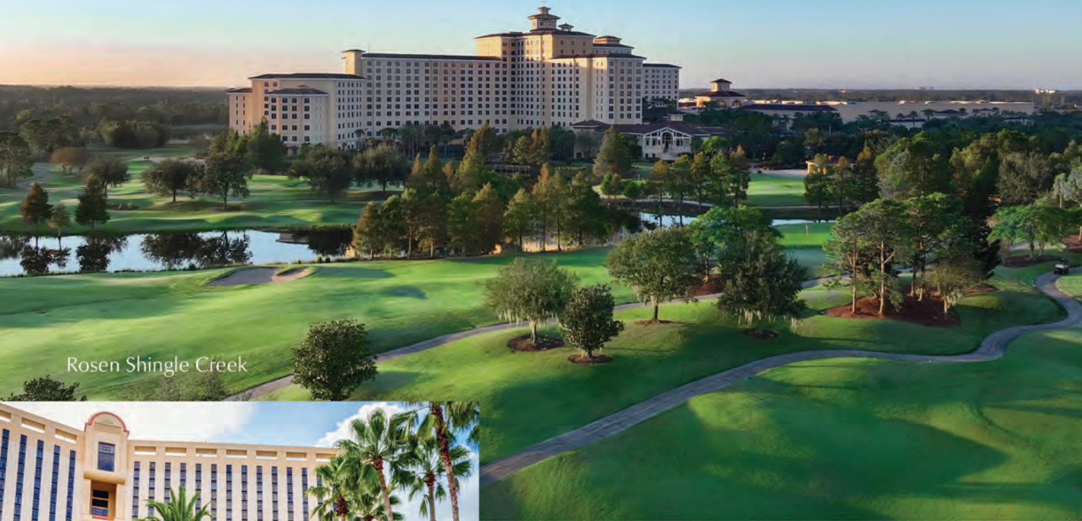
Rosen Shingle Creek