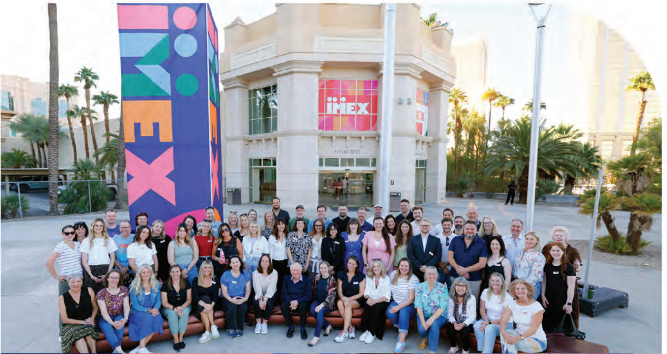
Above: The IMEX team in Las Vegas 2024